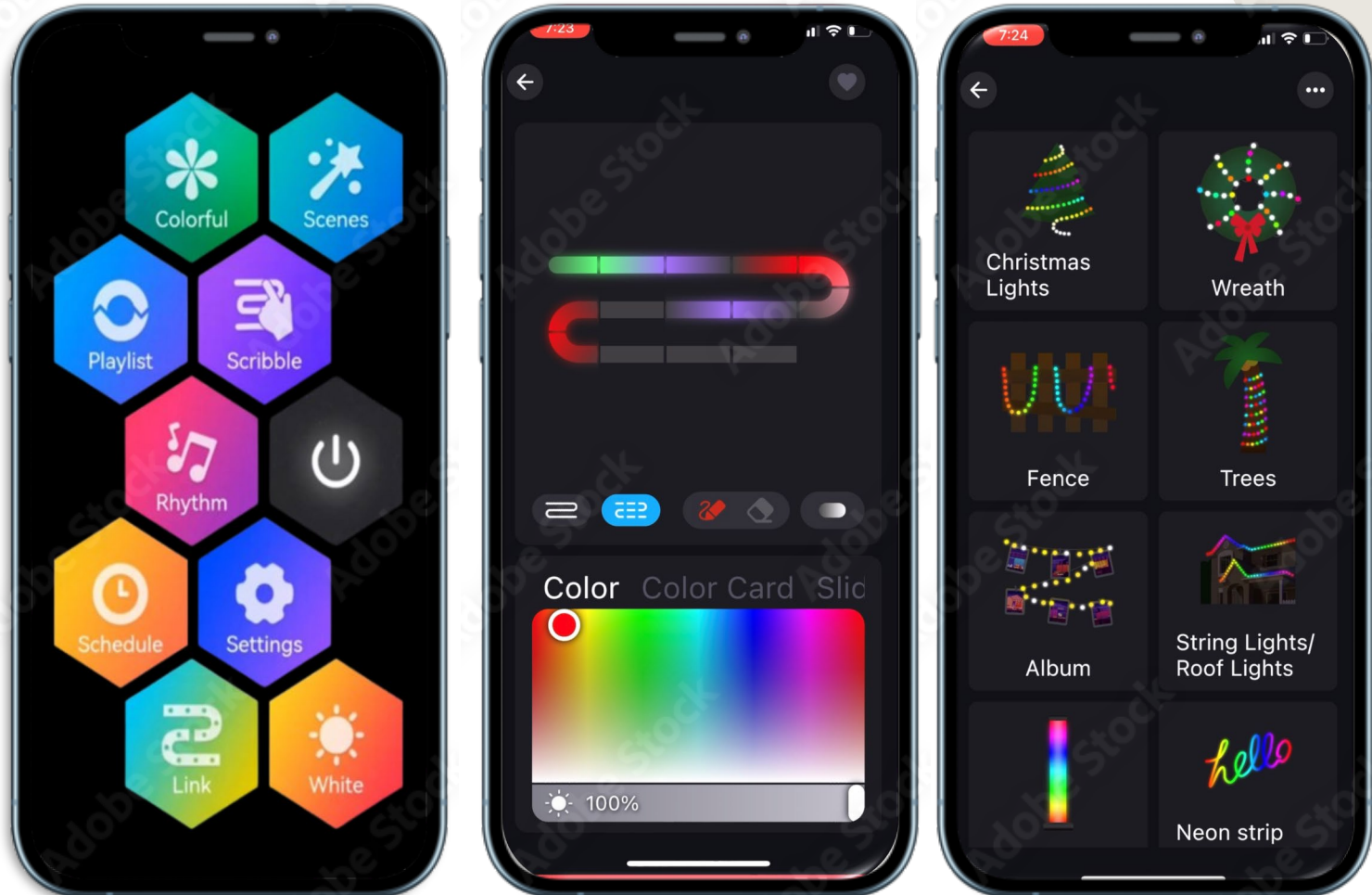
All on a Smart Phone